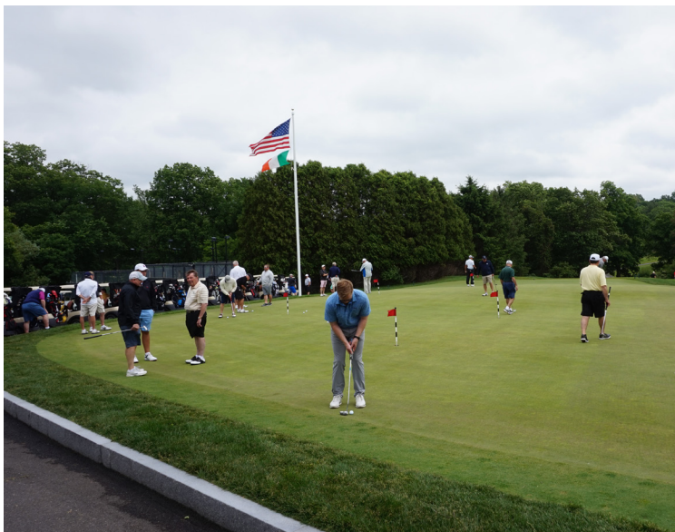
Golfers warm up before the shotgun start