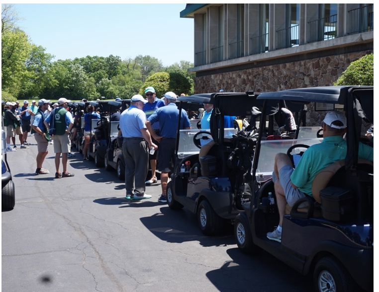
A beautiful day for the Partnership's golf tournament