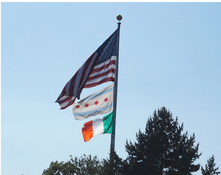
The Irish flag flew outside Beverly on June 5th to celebrate the Partnership's annual tournament