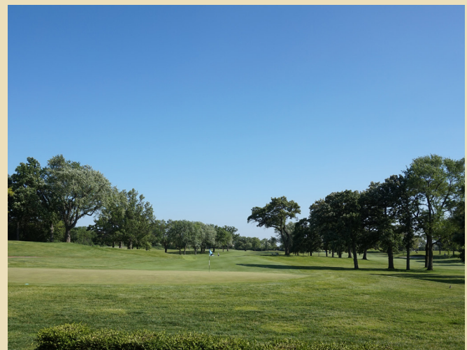
The beautiful weather made for an enjoyable day on Beverly's pristine greens