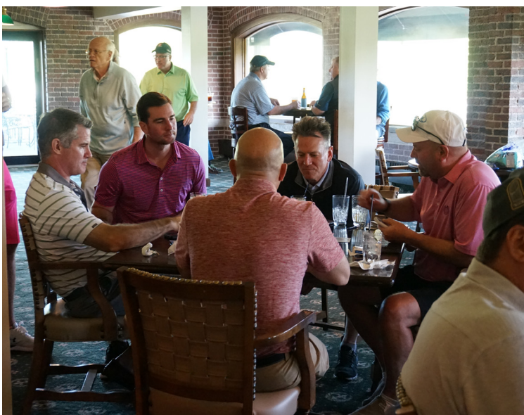
Golfers enjoying the cocktail reception