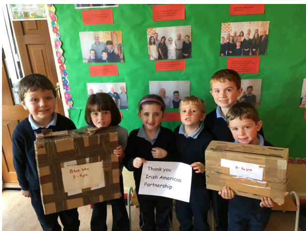
Students at St. Caillin's with their new books

"This funding provided by you has made a huge difference here, and has provided the pupils with attractive books and more stimulating learning experiences. As funding for schools in Ireland has diminished in recent times, we are particularly grateful for your kind donation at this time."