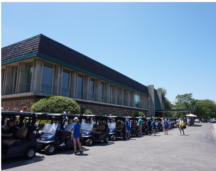
Golfers prepare for the shotgun start