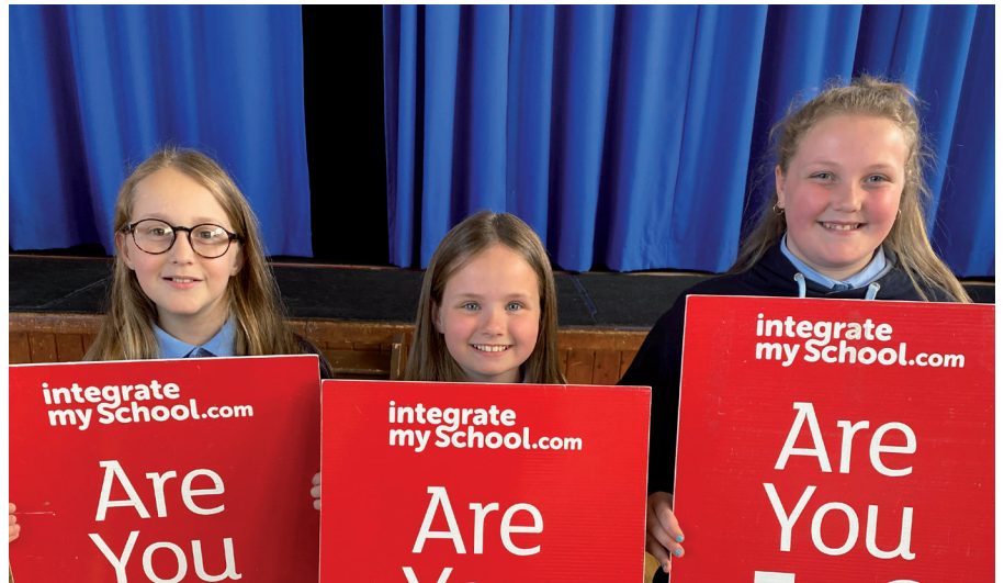
Pupils at Carrickfergus Central Primary School