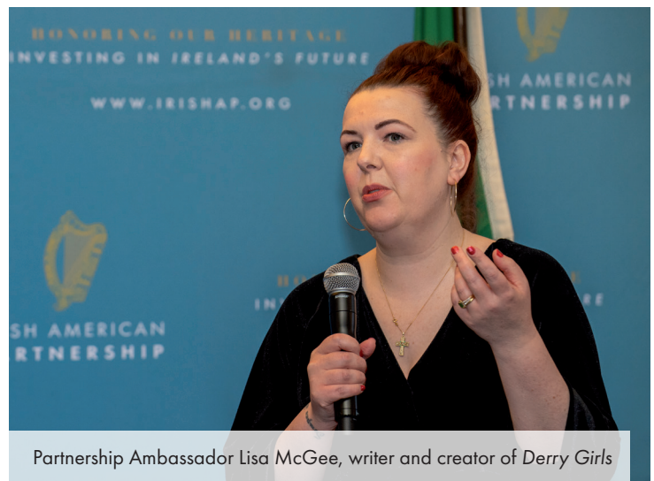
Partnership Ambassador Lisa McGee, writer and creator of Derry Girls