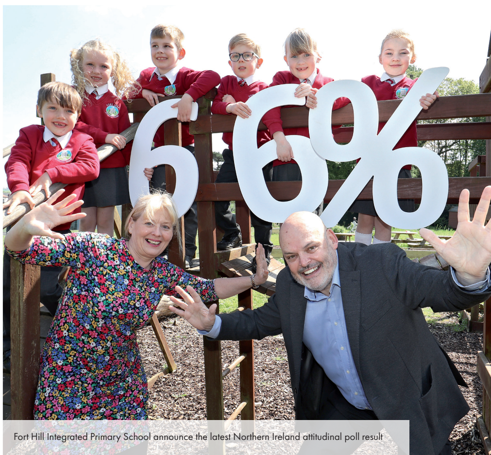
Fort Hill Integrated Primary School announce the latest Northern Ireland attitudinal poll result

Actor and IEF Ambassador Liam Neeson continues to advocate for this vision of a united community and a shared future, saying,