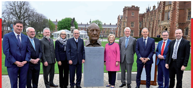
Global leadership and key architects of the Good Friday Agreement