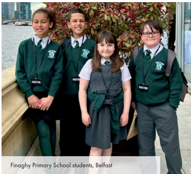
Finaghy Primary School students, Belfast