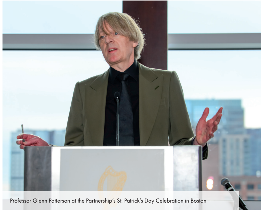
Professor Glenn Patterson at the Partnership's St. Patrick's Day Celebration in Boston

He went on to say that as a result of these outreach projects the Seamus Heaney Centre will “more than ever be a link between the past and the future, between the city and Queen's University, between writing here and elsewhere. A centre with Heaney at its heart – a stellar poet who excelled in other genres and forms and who never stopped enquiring – a centre where writing lives.”