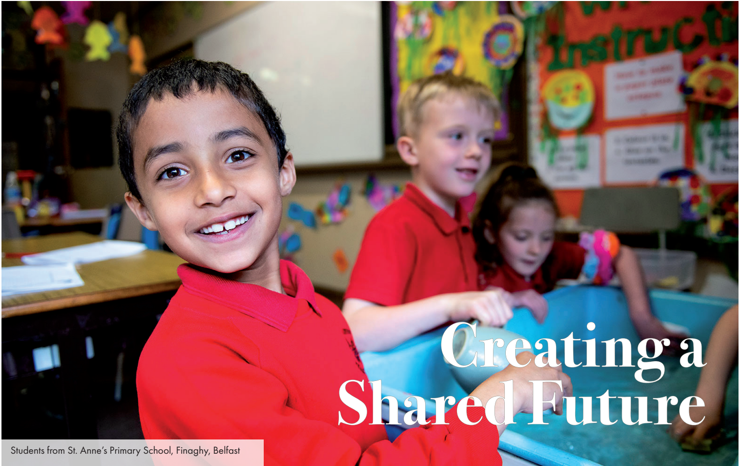
Students from St. Anne's Primary School, Finaghy, Belfast