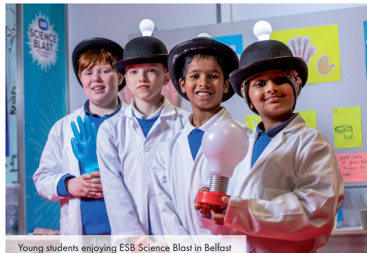
Young students enjoying ESB Science Blast in Belfast

*ESB Science Blast / the Partnership specifically focus on DEIS schools to include children who might normally be overlooked by STEM programs.