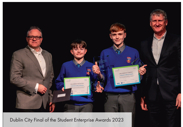
Dublin City Final of the Student Enterprise Awards 2023

“ Thanks to the Irish American Partnership, the remainder of your generous grant will enable us to support even more enterprises in the next academic year. ”