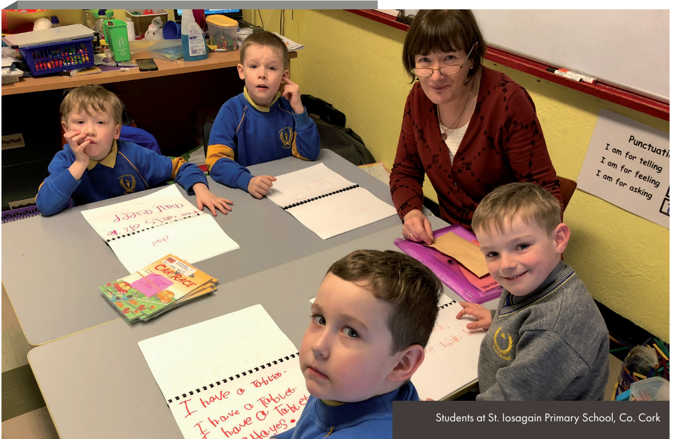
Students at St. Iosagain Primary School, Co. Cork