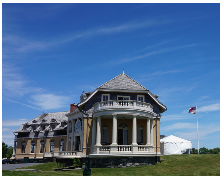
A beautiful day on Newport's scenic course