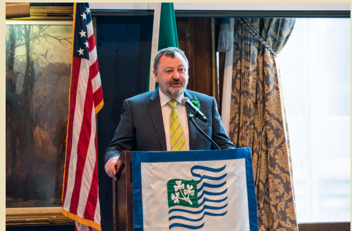
Irish Senator Denis O'Donovan, Cathaoirleach of Seanad Éireann, gave the keynote address