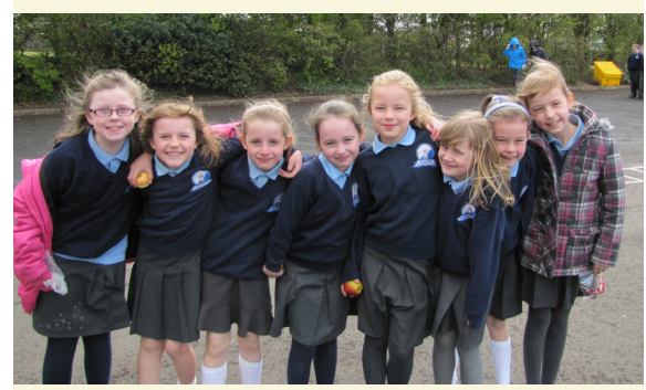
Students at Glengormley Integrated Primary School in Northern Ireland