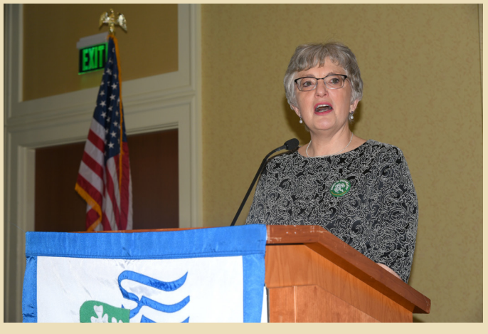
Minister of Children and Youth Affairs Katherine Zappone addresses the audience