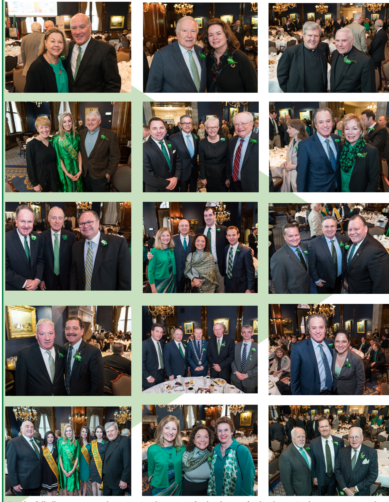
See the full album on our website www.irishap.org or facebook www.facebook.com/irishamericanpartnership